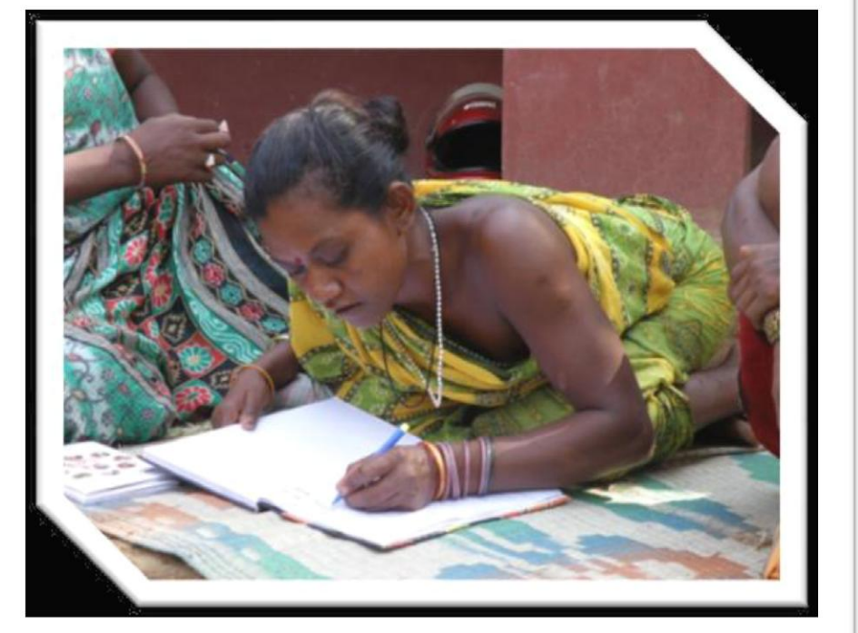
Dignity to life Opportunity for her child